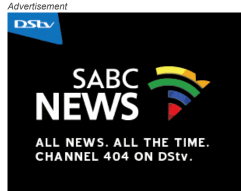
World Cup 2014 news

African EduWeek is the premier education exhibition in South Africa and the \mbox{\it m}\mbox{\it \iota}